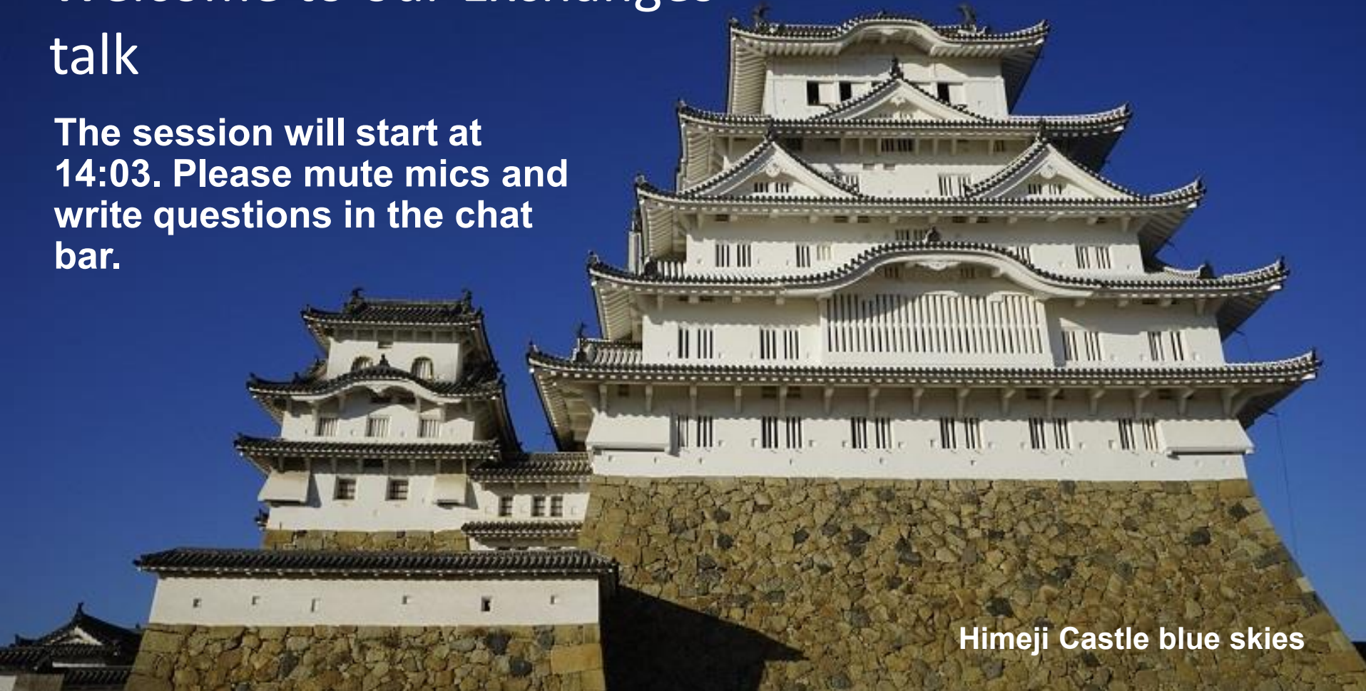
Himeji Castle blue skies

The session will start at 14:03. Please mute mics and write questions in the chat bar.